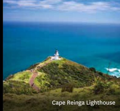
Cape Reinga Lighthouse

With average high temperatures ranging from 21 degrees Celsius to 25 degrees Celsius (77°F), summer in New Zealand is hot without being muggy. Sunshine hours are high, and rain is not overly common in most places.