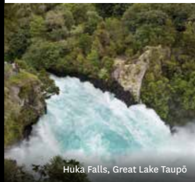
Huka Falls, Great Lake Taupō