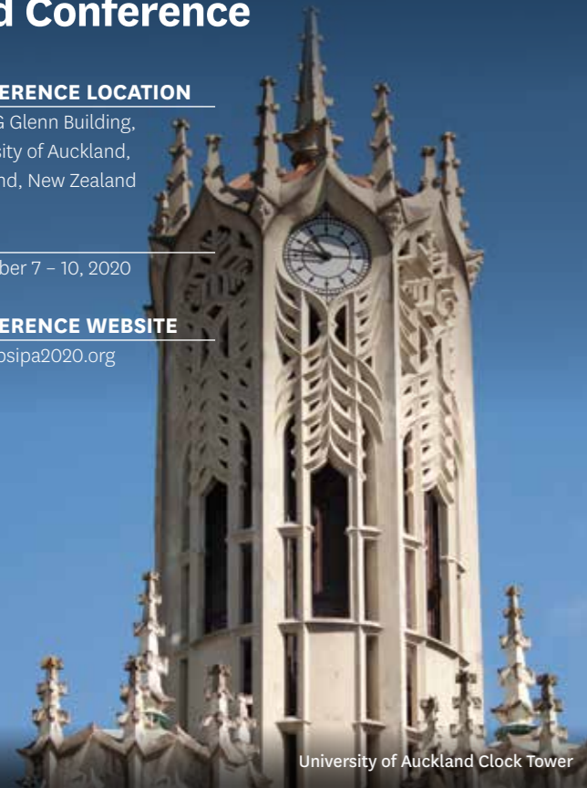
University of Auckland Clock Tower