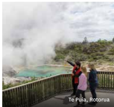
Te Puia, Rotorua