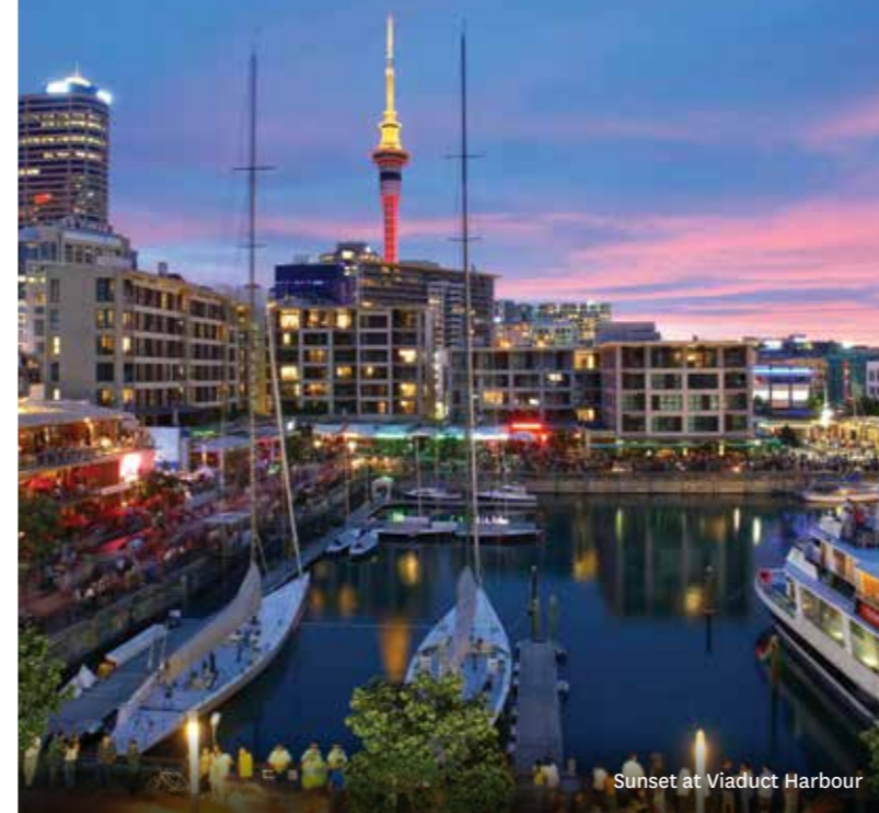
Sunset at Viaduct Harbour

With over 7,000 rooms available in the CBD, from five-star international hotels to budget-friendly backpackers, Auckland has options to suit everyone.